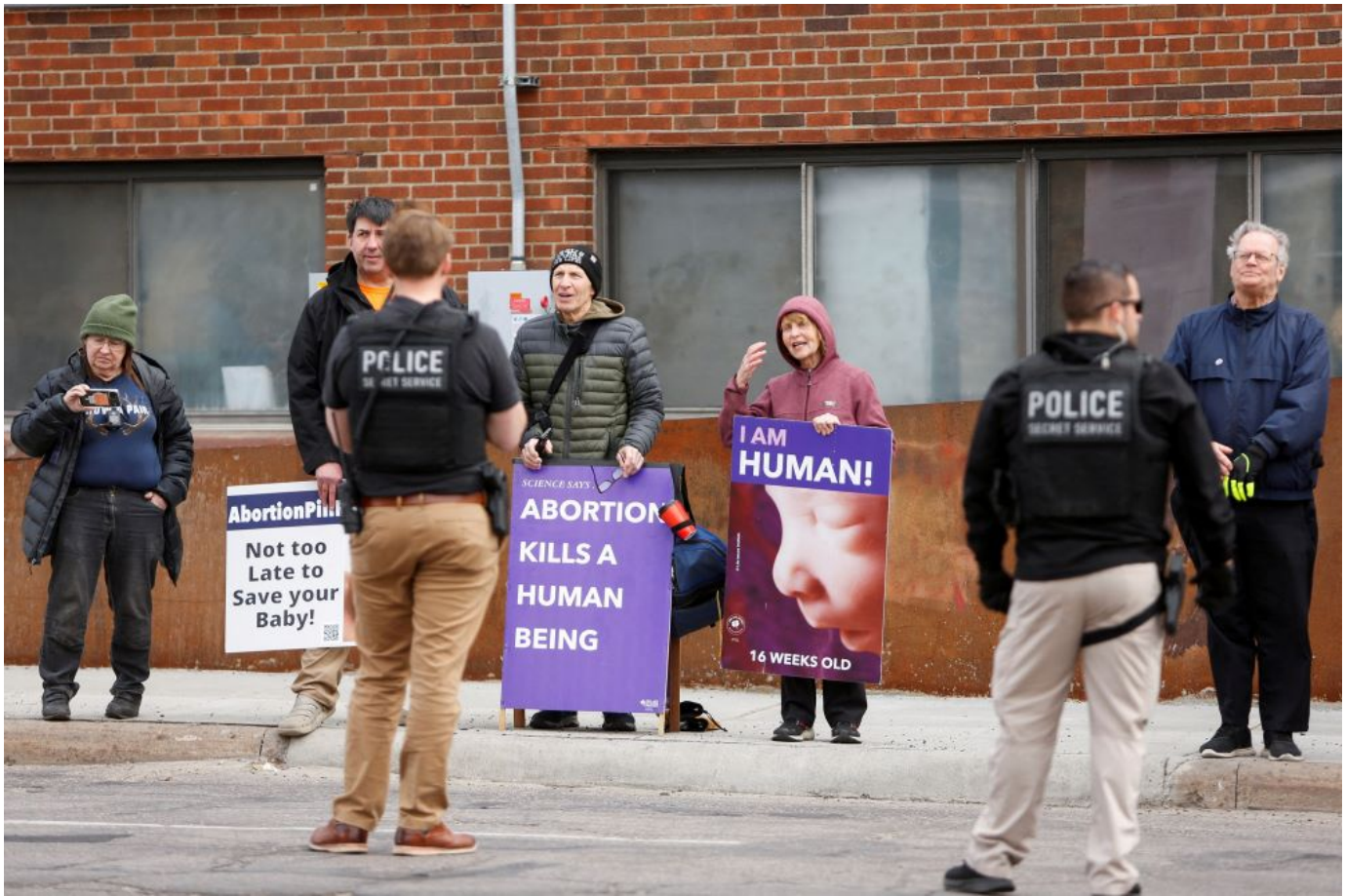
Abortion opponents demonstrate as U.S. Vice President Kamala Harris visits an abortion clinic in Minneapolis March 14.

But what about abortion? This is the argument I heard for years. No matter how terrible a Republican candidate was, we still had to support them, because of abortion. No matter how strong a Democratic candidate was on the economy, health care, just war, capital punishment, immigration or other life issues, we still had to oppose them, because of abortion. Today, some who identify as staunchly pro-life might still withhold support from Harris because of her position on reproductive health issues. And yes, Harris is very pro-choice and does plan to codify Roe v. Wade's protections into law.