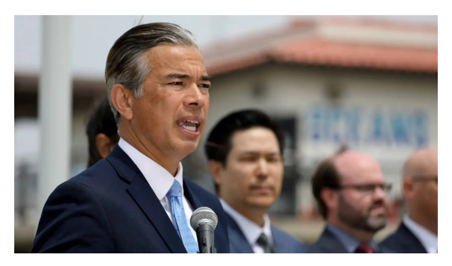
California Attorney General Rob Bonta.

The lawsuits single out Exxon Mobil as the world's largest producer of polymers used to make single-use plastics — products like grocery bags, cutlery and takeout containers that are used for just a few minutes before being thrown away. These products, along with packaging, account for <a href="nearly 40 percent of global plastic production">nearly 40 percent of global plastic production</a>, and are unlikely to be recycled due to technological and economic constraints.