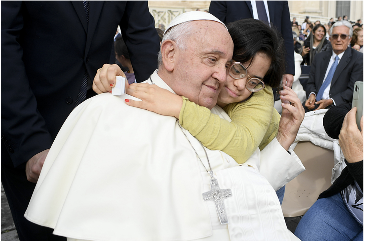
Pope Francis receives a hug from a child after his weekly general audience in St. Peter's Square at the Vatican Oct. 9, 2024.