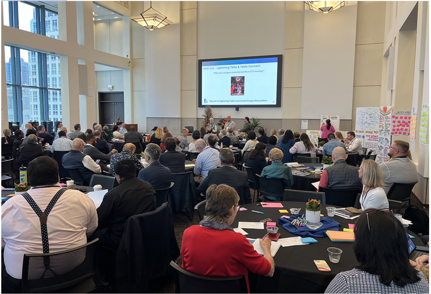
Attendees are pictured at the first Catholic Social Teaching and Investing Summit in Chicago, held Sept. 25-26.

Opinion NCR Voices Columns Social Justice