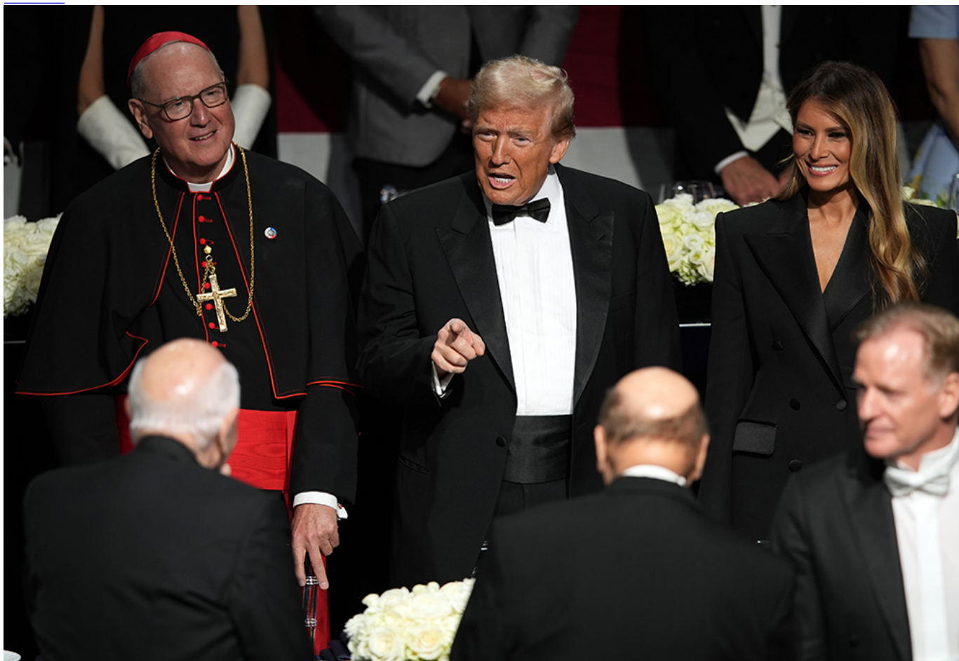
Republican presidential nominee former President Donald Trump and former first lady Melania Trump arrive for the 79th annual Alfred E. Smith Memorial Foundation Dinner, Oct. 17 in New York.