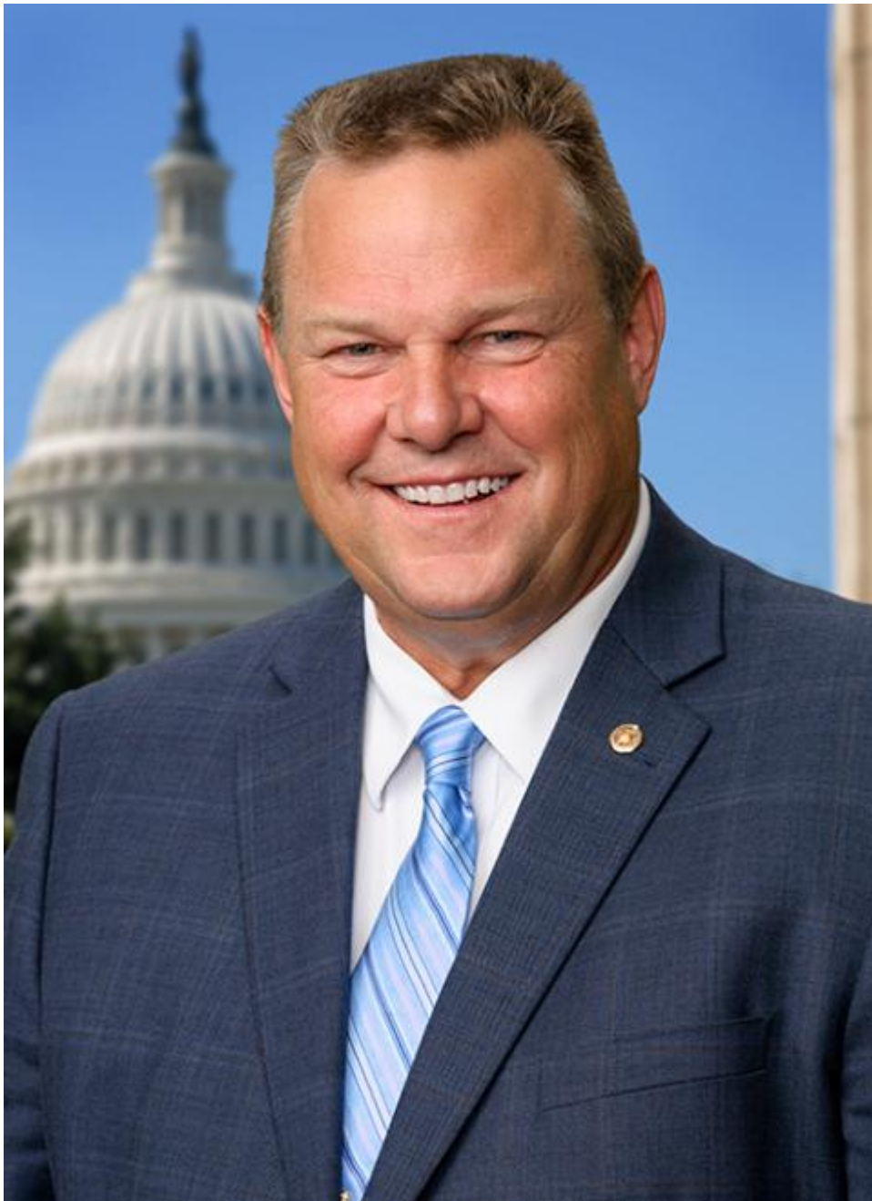
Official portrait of Sen. Jon Tester of Montana

In Montana, former Navy SEAL and businessman Tim Sheehy has opened up a consistent lead over incumbent Democratic Sen. Jon Tester. Sheehy's business is no mom-and-pop shop: He makes about $5 million a year as CEO of an aerial firefighting company, and an additional $2 million in non-investment income from other ventures. He is not self-funding; A gaggle of billionaires is pouring money into the race . Tester, a farmer, is not poor, to be sure. His net worth is over $3.6 million.