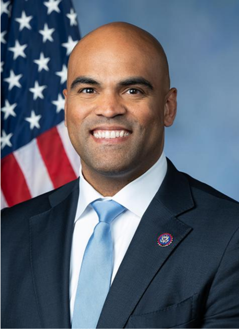
Official portrait of Rep. Colin Allred ( allred.house.gov )