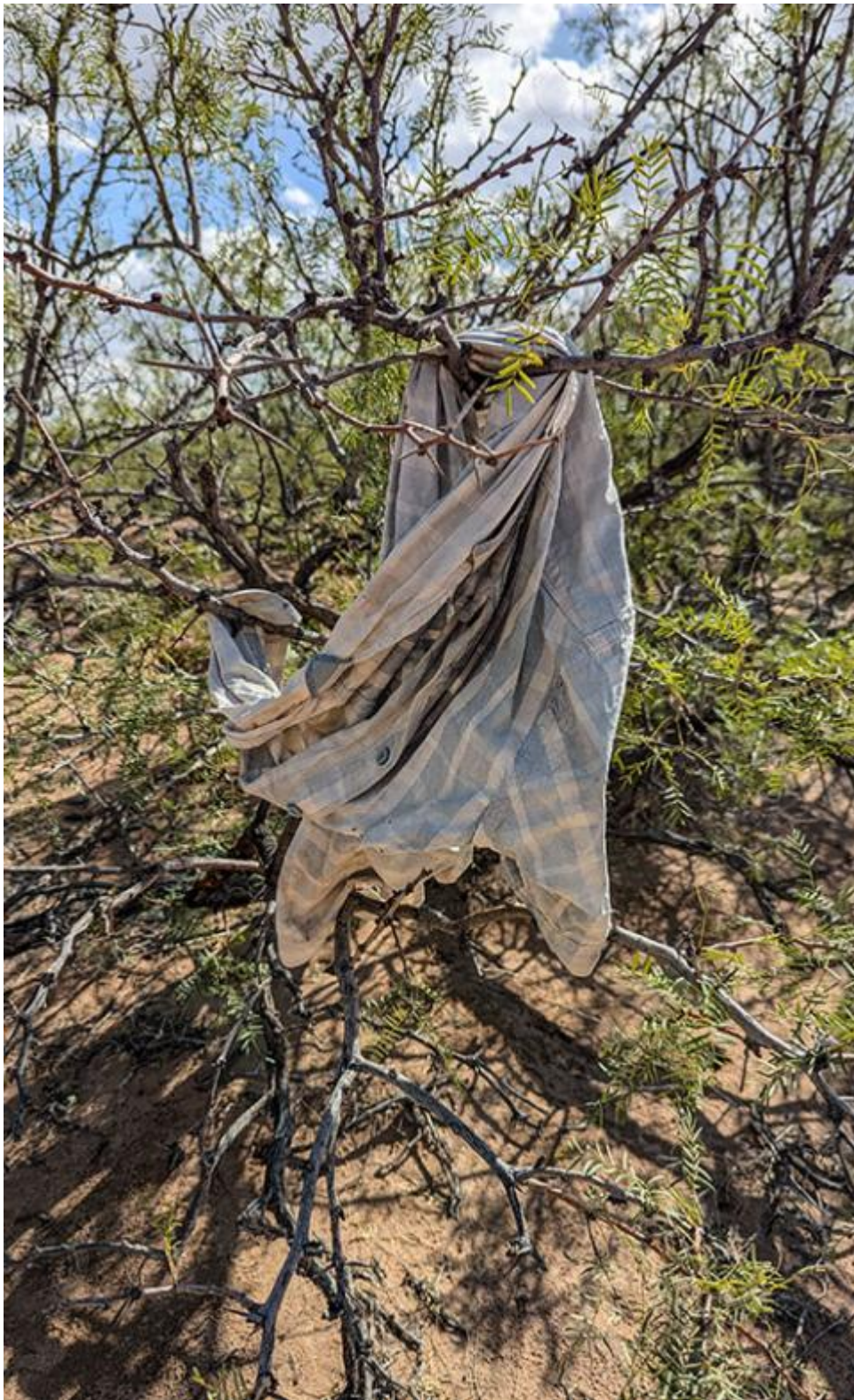
A woman's shirt dangles from the branch of a bush in the Santa Teresa Desert in southern New Mexico.