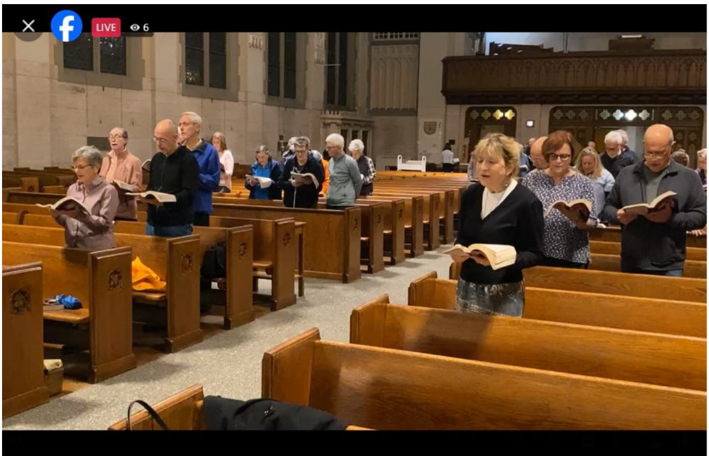
More than 60 members of St. Gertrude Parish in Chicago gather Nov. 4 for an election prayer service.

"They 'saw Trump coming, long ago.' I'm hoping that our thesis that the US system is robust enough to thwart an impetuous bully will not be put to the test."