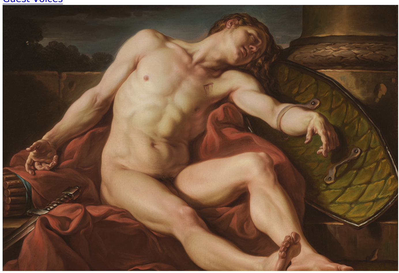
"A Dying Gladiator" (1773) by Jean-Simon Berthélemy