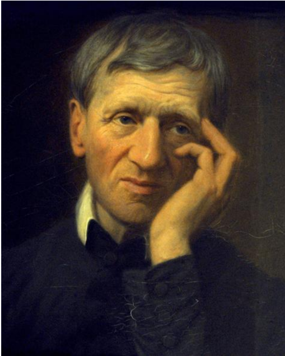
St. John Henry Newman, pictured in an undated painting