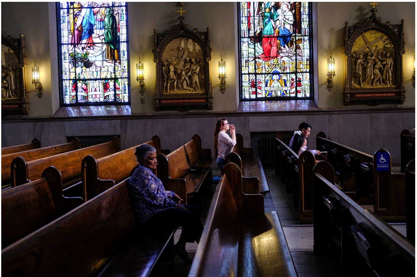
A parishioner prays at St. Peter the Apostle Catholic Church in Reading, Pa., on June 16, 2024. The Reading Eagle reported in November that Trump captured nearly 35%

Other surveys of Hispanic Catholics indicate only a slight increase in affiliation with the Republican Party over the past decade, while also seeing a corresponding increase in affiliation with the Democrats (offset by a decline in those identifying as independent). Hispanic Catholics are also less likely to identify as conservative today as they were a decade ago.