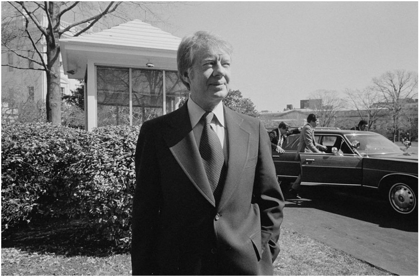
Then-President Jimmy Carter poses at the White House in Washington March 8, 1977.

President Carter was a deeply moral man. At the last meeting of the Cabinet, I remember Vice President Walter Mondale saying, "We told the truth. We obeyed the law. And we kept the peace." That was hard. The political pressures on Carter to resort to force were immense. But by patient diplomacy, the hostages came home. There were many times when we urged a more politically expedient approach to congressional matters — for example, the timing of the Panama Canal and SALT II treaties. He would not compromise though, and in the end, he was right.