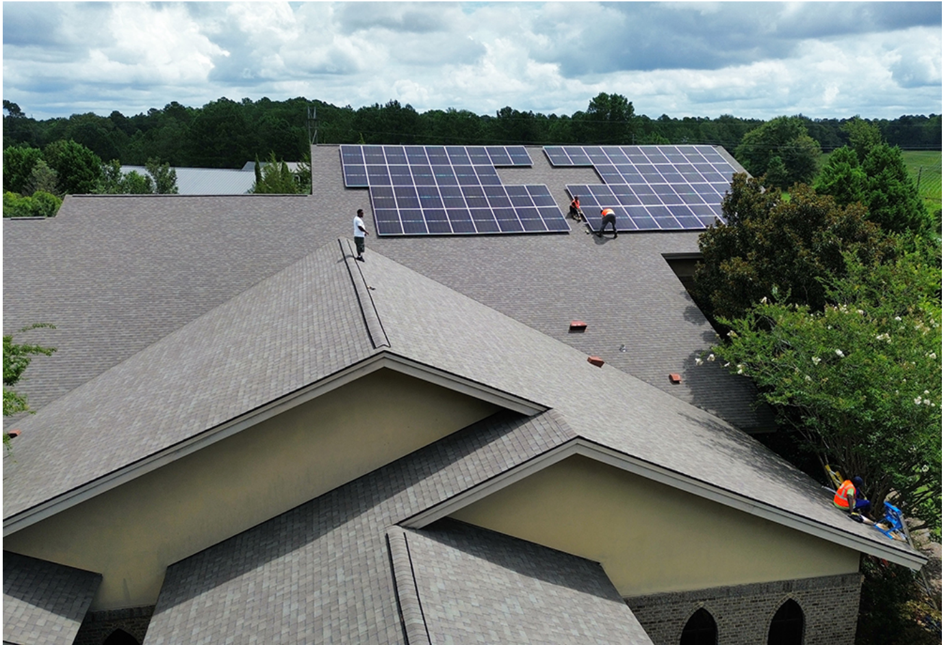
A solar installation is pictured at Trinity Episcopal Church in Statesboro, Georgia, on July 25, 2024.