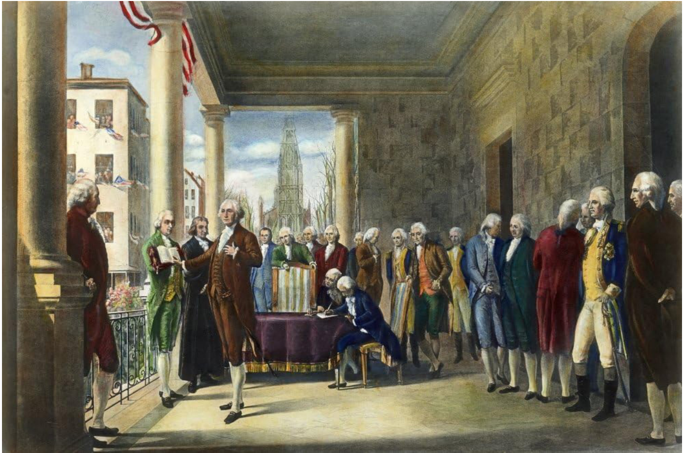
Oil painting of George Washington's inauguration as the first President of the United States which took place on April 30, 1789. (Ramon de Elorriaga/Encyclopedia Britannica/Wikimedia Commons)