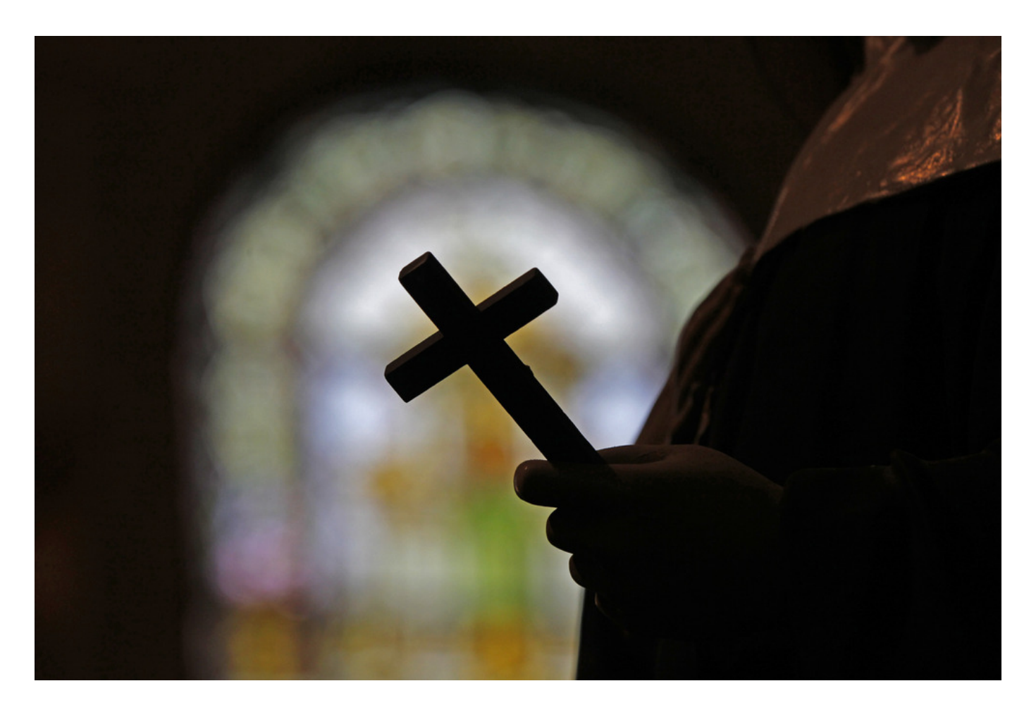
This Dec. 1, 2012 file photo shows a silhouette of a crucifix and a stained glass window inside a Catholic Church in New Orleans. In April 2024, Louisiana State Police carried out a sweeping search warrant at the Archdiocese of New Orleans, seeking a long-secreted cache of church records and communications between local church leaders and the Vatican about the church's handling of clergy sexual abuse.