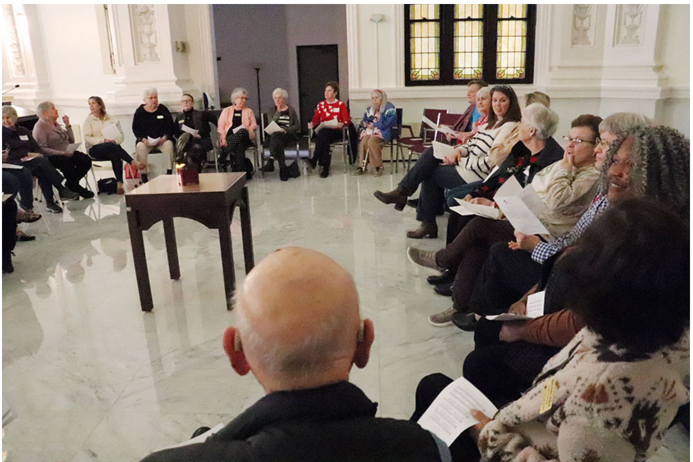
Associates of the Ursuline Sisters of Louisville meet at an associates meeting in February 2024.