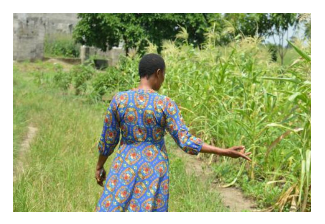
A local farmer affected by oil spills stands in the middle of her farmland.

Shell's divestment follows growing pressure from locals and environmental activists for the environmental damage caused by its operations since oil exploration started in the region in 1956. The company said it aims to reduce its carbon footprints in the region and will remain a major investor in Nigeria's energy sector through its deepwater projects and gas businesses.