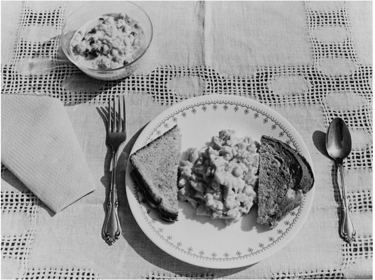
An example for a simple meal for the 1976 Operation Rice Bowl campaign consists of egg salad, toast and rice pudding.