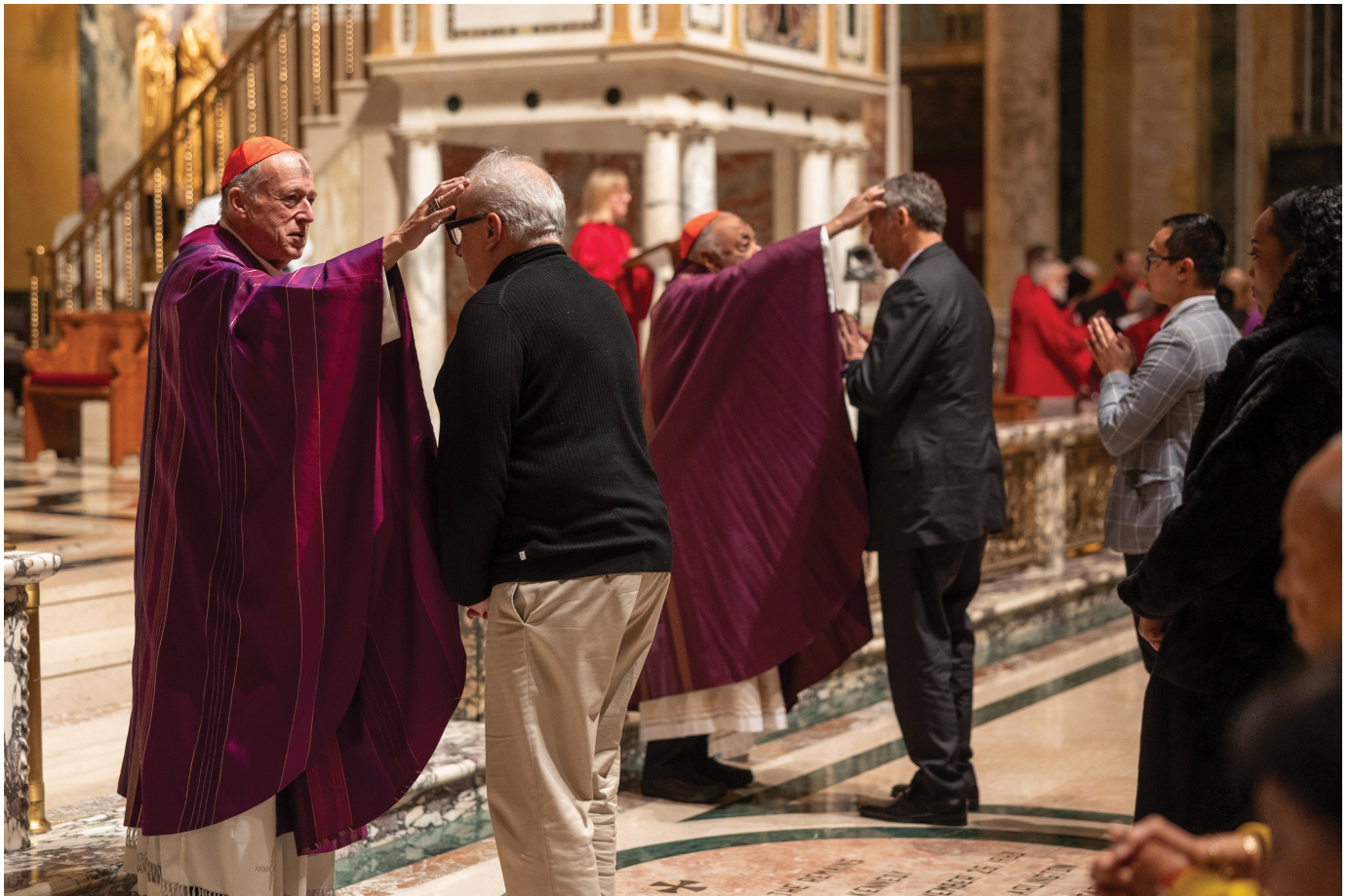
Cardinal Robert W. McElroy, left, and Cardinal Wilton D. Gregory, the retiring archbishop of Washington, dispense ashes during Ash Wednesday Mass March 5, 2025, at the St. Matthew the Apostle Cathedral in Washington.