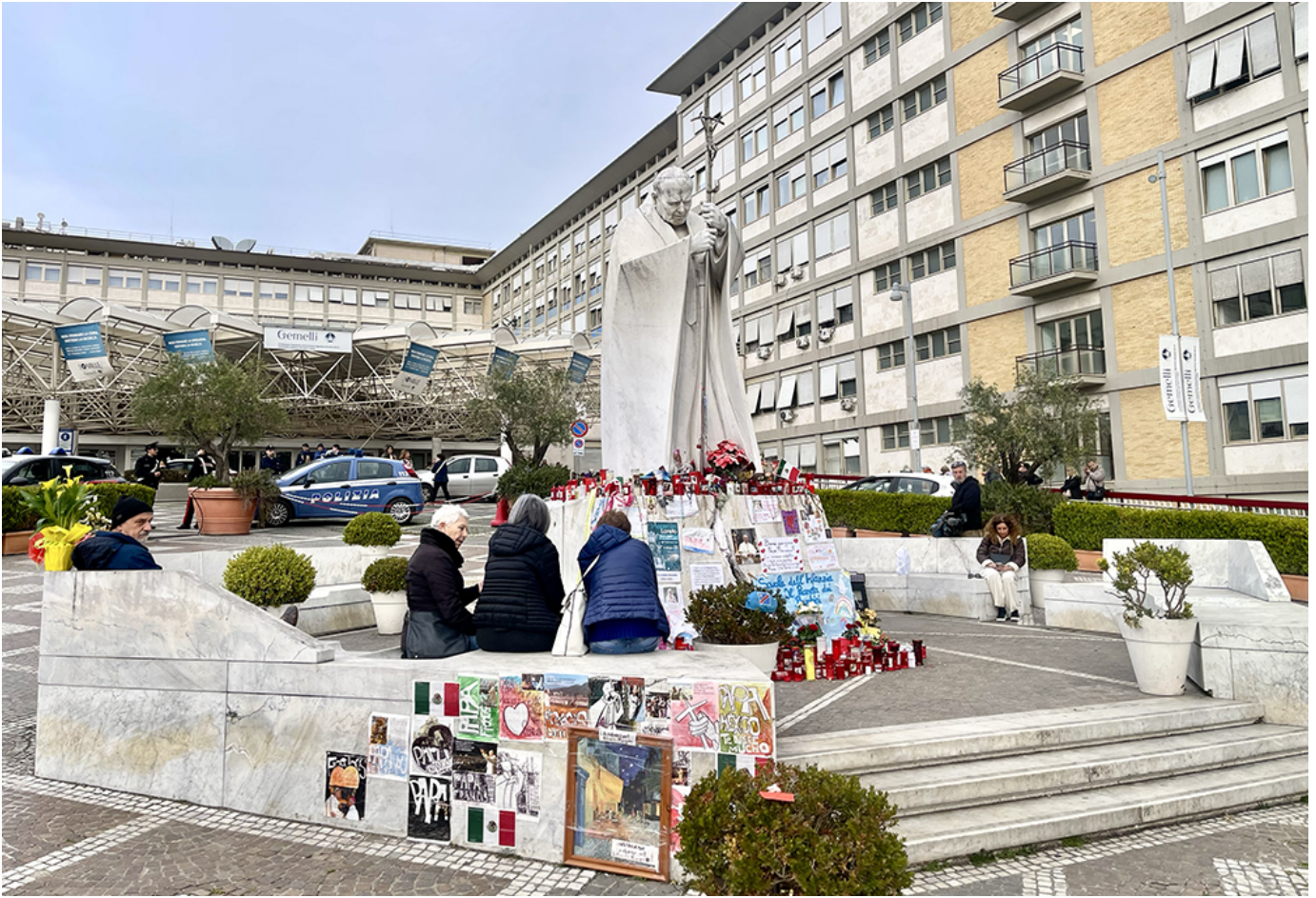
The St. John Paul II statue is pictured in the main courtyard at Gemelli Hospital in Rome.