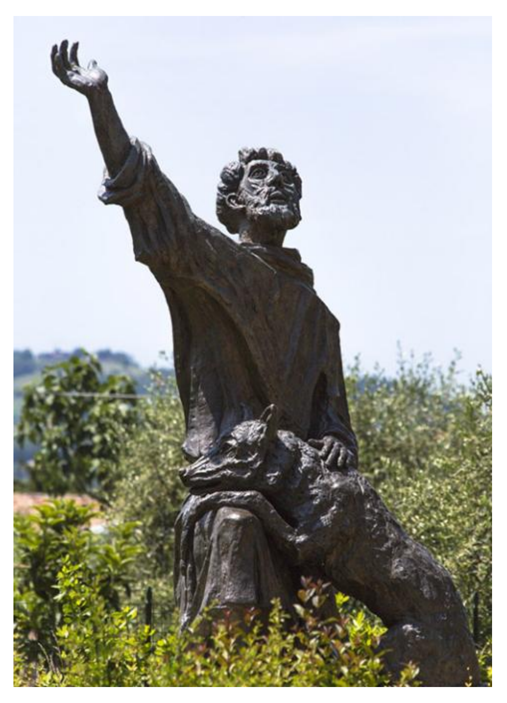
A statue of St. Francis of Assisi and a wolf is seen May 30, 2015, in the town of Gubbio, Italy.

In Italy, for example, the reintroduced grey wolves of the Apennine Mountains have become crucial to maintaining a healthy balance by controlling deer populations that might otherwise overgraze plants and disrupt the ecosystem. The same is true in America's Yellowstone National Park and Isle Royale National Park.